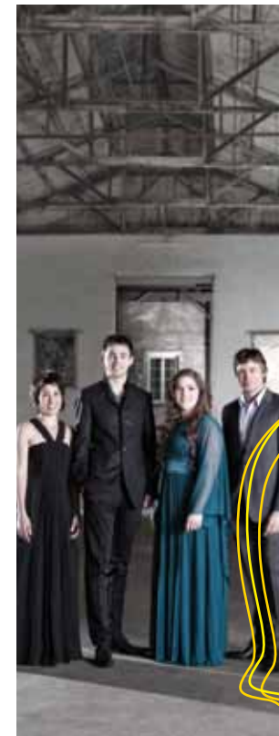
Presented in association with Musica Viva.