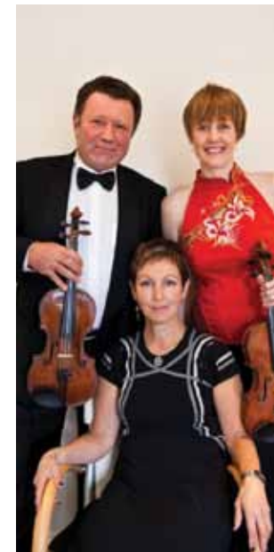
This performance is generously sponsored by the Friends of the Port Fairy Spring Music Festival.